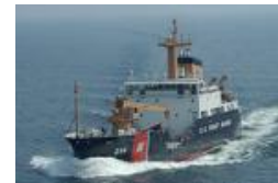
Integrated Deep Water Systems