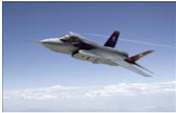
F-35 Joint Strike Fighter