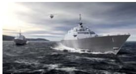
Littoral Combat Ship