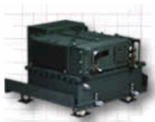
Shortstop Electronic Protection System