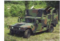
Joint Enhanced Core Communications Systems